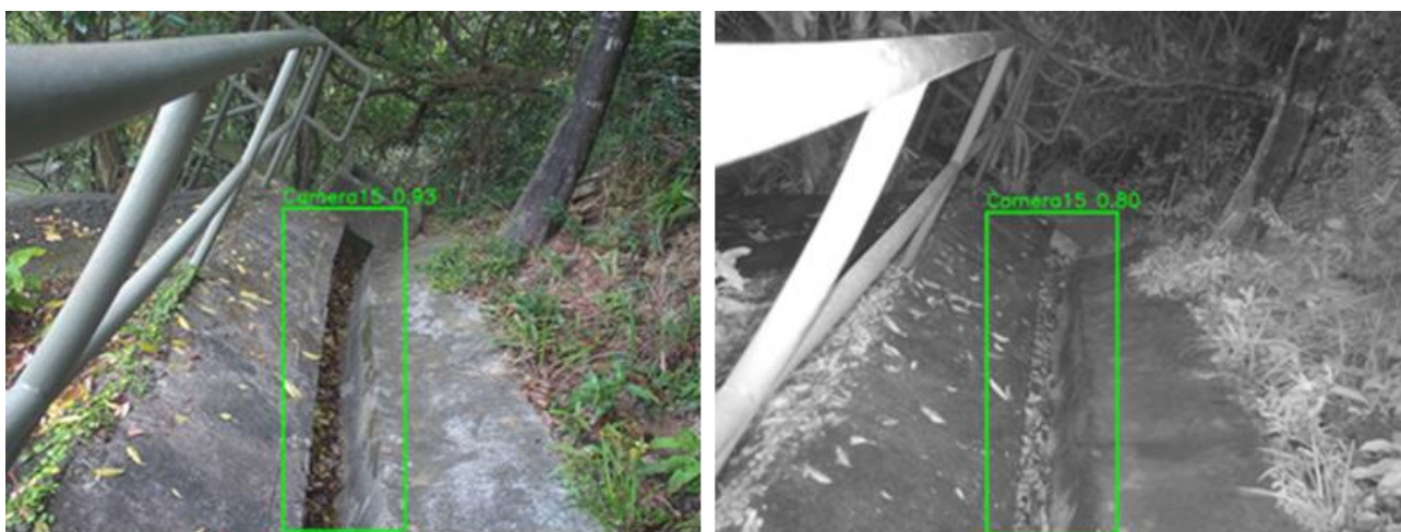
Plate 9 Captured Image with AI for alarm verification during daytime and nighttime

The verification camera system is also being upgraded to address practical challenges identified during field trials. Improvements include enhanced camera housing designs for increased durability in harsh environmental conditions. Furthermore, AI capabilities are being integrated into the camera system to assist in automated false alarm verification with pattern and feature detection. This AI-driven feature will help reduce the need for manual intervention, particularly during extreme weather conditions, thereby streamlining the monitoring process.