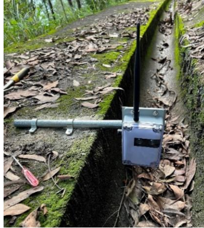
Plate 3 Laser Obstruction Sensor