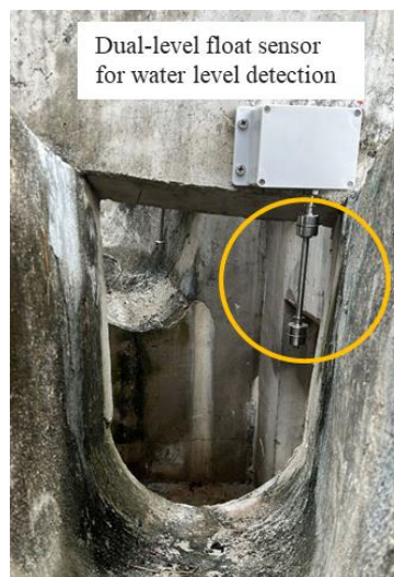
Plate 1 Water Triggering Sensor

These sensors operate using a dual-float mechanism. As water levels rise within the drainage channel, the first float is lifted, triggering an initial response. If the water level continues to increase and reaches a critical threshold, the second float is activated, triggering the sensor. This activation enhances the system's measurement frequency and prompts image capture, which ensures timely and effective detection of potential drainage issues.