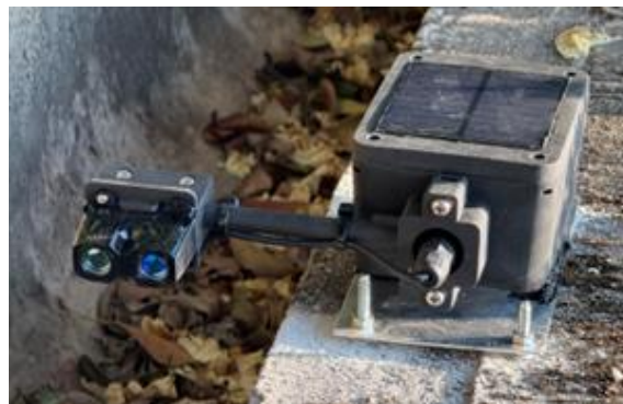
Plate 7 Miniaturized Laser Obstruction Sensor

Drawing from valuable practical experience and insights accumulated during the ongoing site trials, the SSDMS is currently undergoing continuous enhancements to further improve its effectiveness, adaptability, and resilience. One primary area of enhancement involves the miniaturization and adaptation of sensors specifically tailored for constrained drainage environments. By reducing sensor dimensions and refining their physical profiles, the enhanced SSDMS will be better suited for installation in narrower or more space-restricted drainage channels.