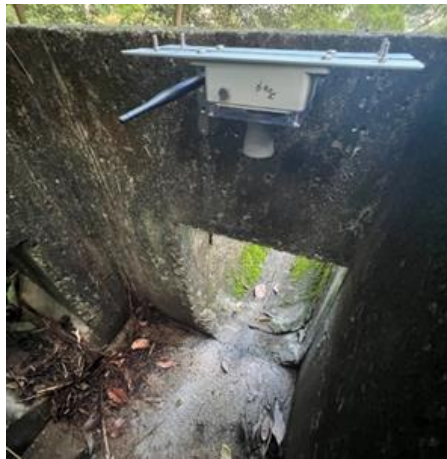
Plate 2 Ultrasonic Depth Sensor

During the extreme rainstorm in September 2023, the ultrasonic sensors consistently delivered reliable performance despite the challenging conditions. While minor acoustic interference was observed, primarily caused by heavy splashing and turbulent flow, these effects only led to brief fluctuations in depth readings. Importantly, these anomalies did not result in any false alarms or incorrect system triggers.