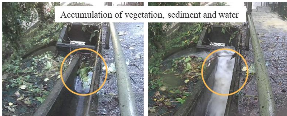
Plate 6 Image Captured by the Verification Camera