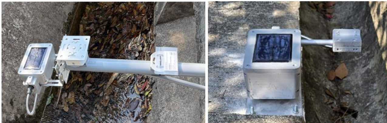
Plate 8 Solar Powered Sensors

Another critical area of ongoing enhancement is optimizing power supply configurations to improve overall energy efficiency. This involves integrating solar energy harvesting technologies along with rechargeable battery modules that feature an automatic power detector and switch within the system design. The switch will manage the power source, alternating between a high-capacity non-rechargeable battery and a solar battery. Such enhancements will significantly extend battery life and reduce maintenance frequency, making the system suitable for remote locations or areas where frequent manual servicing is challenging.