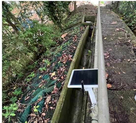
Plate 4 Verification Camera

The SSDMS is equipped with digital cameras integrated with night vision capabilities and a solar power system. Upon receiving alerts from other sensors (i.e. water-triggering, ultrasonic, or laser sensors), the camera automatically activates and captures images of the monitored area. These images are transmitted wirelessly via the LTE network to the monitoring platform, allowing operators to visually confirm or dismiss alerts as necessary. This visual verification process significantly reduces false alarms, enhances decision-making accuracy, and assists maintenance teams in preparing targeted and effective clearance actions, consistent with findings from recent studies on automated visual blockage classification (Iqbal et al., 2021).